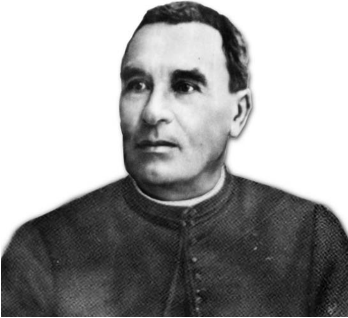
Abbé François Bérenger Saunière 1852 to 1917

Saunière, it seemed, had wasted no time in spending his riches. With no expense spared, he renovated the church to his exact design. He also purchased the land around the church for the grand building projects he had planned, which we can still see today, including the Tour Magdala and a villa.