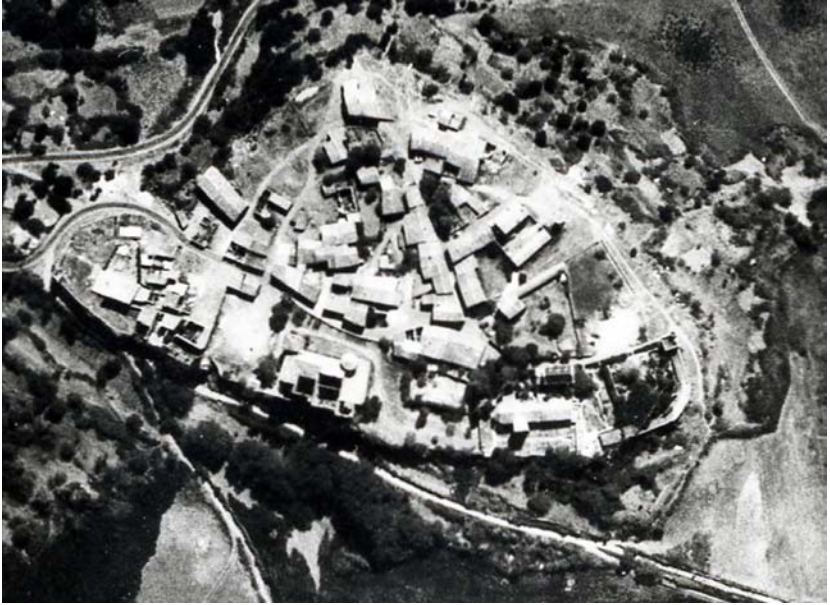
Rennes-le-Château Village—Saunière's Domain is on the right